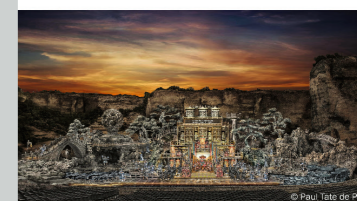
Oper im Steinbruch St. Margarethen 2021

Puccinis unvergängliches Meisterwerk in der einzigartigen Atmosphäre des Steinbruch St. Margarethen