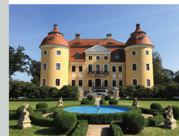
Kammermusikfest Oberlausitz 2021

Das Kammermusikfest Oberlausitz bespielt vom 10. bis 17. September 2021 mit über 30 Klassikern und 7 Konzerten in 6 verschiedenen Schlössern und Kirchen den gesamten Kulturraum Oberlausitz-Niederschlesien.