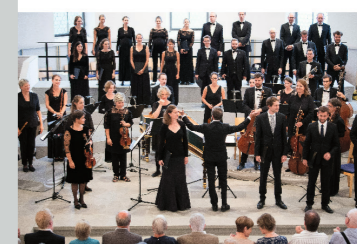
Appenzeller Bachtage 2022

Einer der größten Komponisten aller Zeiten trifft diesen Sommer erneut auf das Appenzellerland und seine Eigenheiten. Die Appenzeller Bachtage - ein unkonventionelles Festival in ungezwungener Atmosphäre.